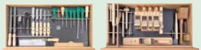
37-piece tool assortment 304 in substructure cabinet 10-20