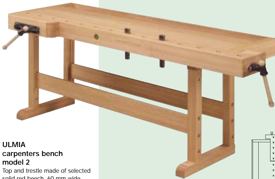
Carpenters bench model 2