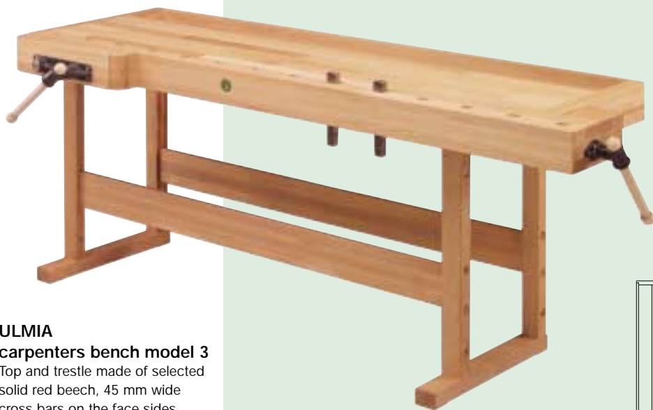
Carpenters bench model 3