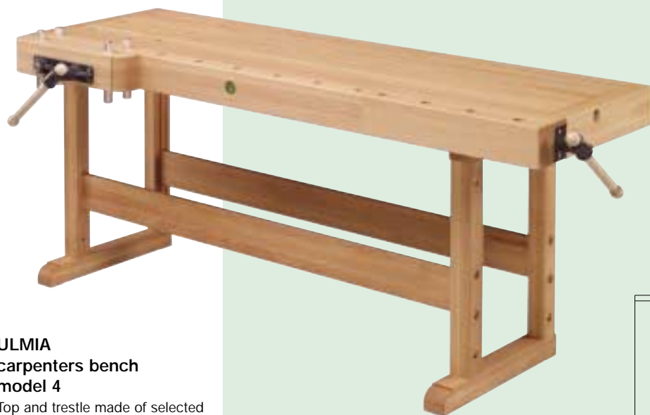
Carpenters bench model 4