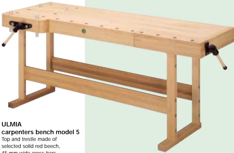
Carpenters bench model 5